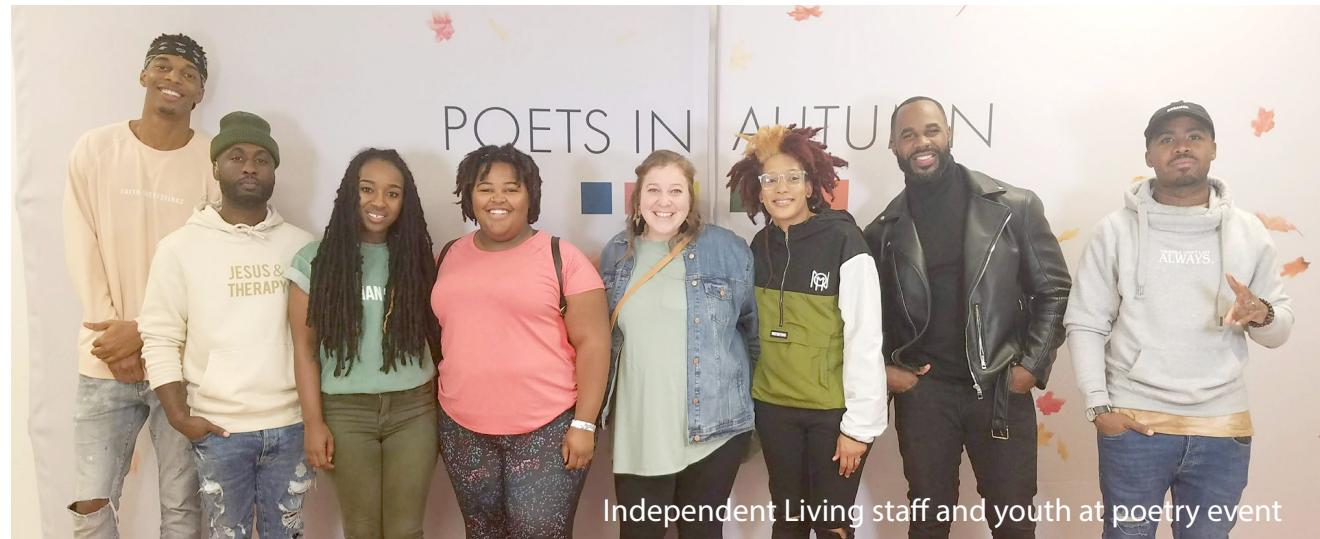
Independent Living staff and youth at poetry event

“We believe that each youth and their family are much more than names and histories on paper”.